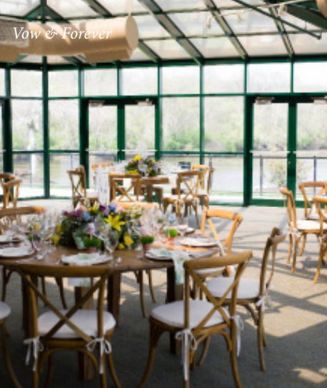
Vow & Forever