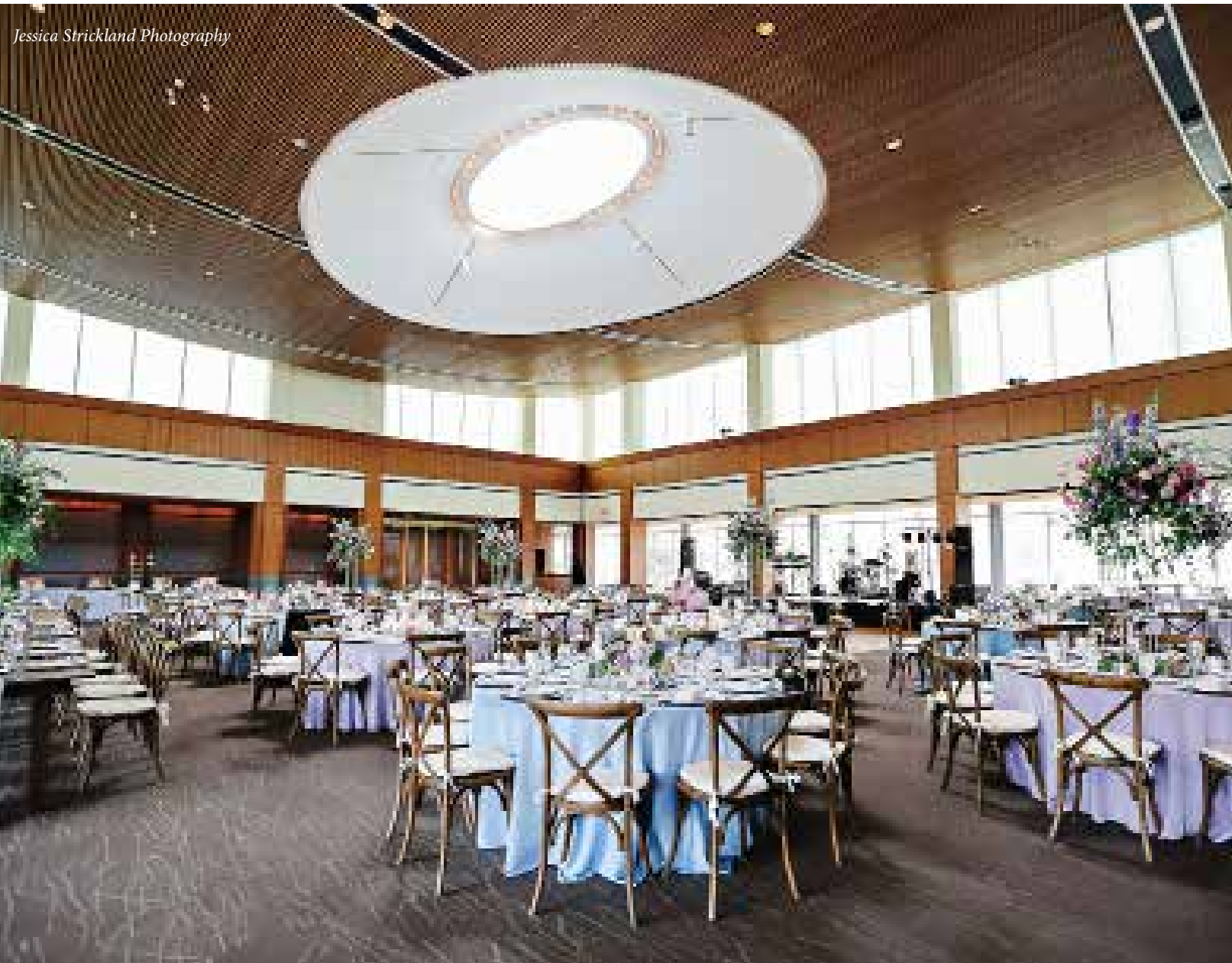
Jessica Strickland Photography